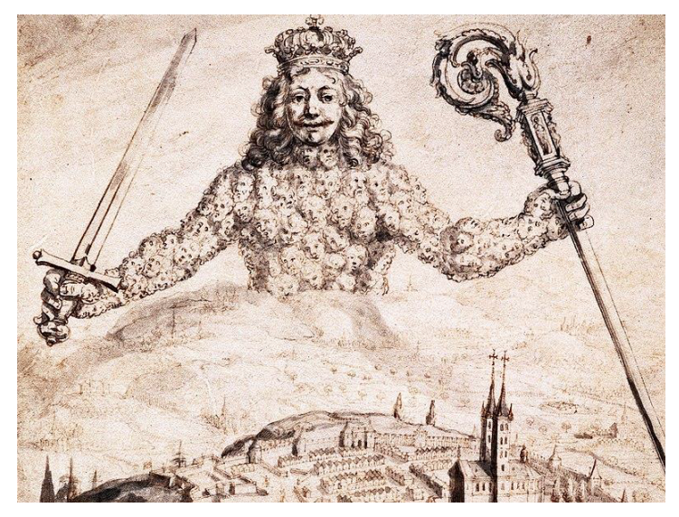
Pen drawing of the frontispiece of the Leviathan manuscript given by Hobbes to Charles II in 1651.

of peace? But the foregoing would be incomplete without a brief look at the nature of the State as theorized by Hobbes. As a picture is worth a thousand words, here is the frontispiece to The Leviathan, illustrated by Hobbes himself: